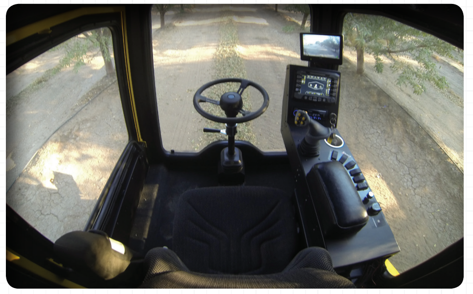
• Large 1/2" Hehr window system for superior visibility

Best visibility on the market Variable speed cleaning fan More cleaning chain area than any other harvester Windboard adjustable from inside cab Extendable hitch Extendable hitch Loystick control puts numerous adjustments at your fingertips Destick control puts numerous adjustments at your fingertips