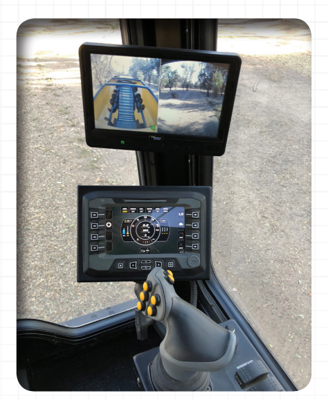
• Total control at your fingertips