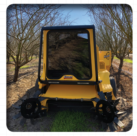
• Set it up for almonds, pecans, or walnuts