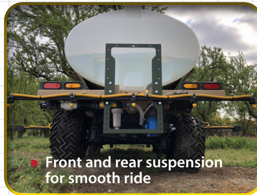
● Front and rear suspension for smooth ride