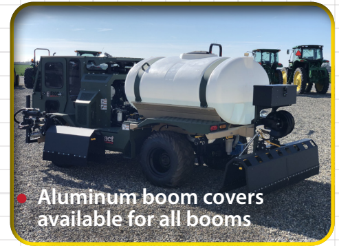
● Aluminum boom covers available for all booms