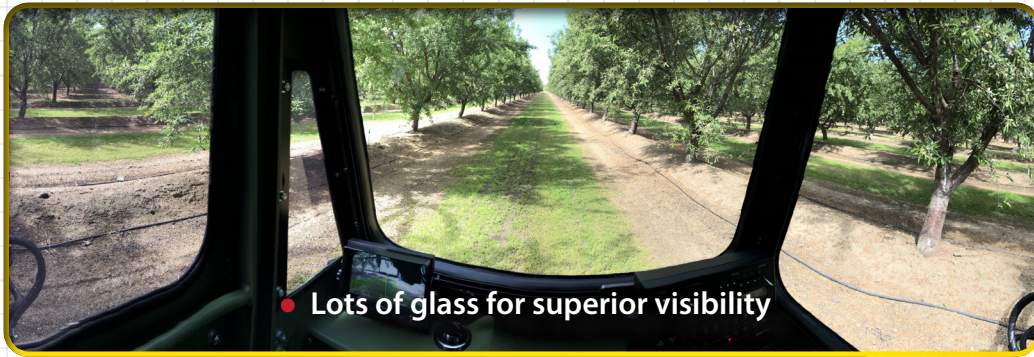
● Lots of glass for superior visibility