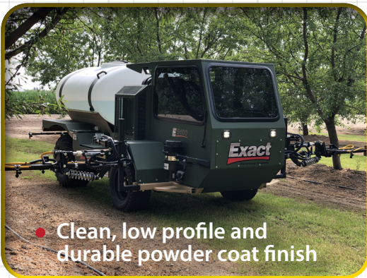
● Clean, low profile and durable powder coat finish