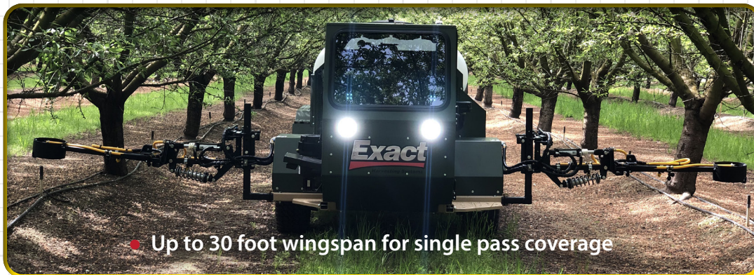
● Up to 30 foot wingspan for single pass coverage