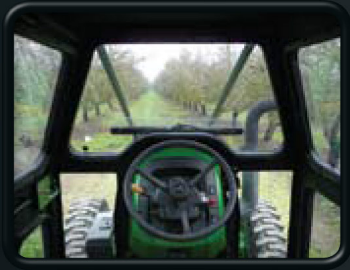
Now with more glass for increased visibility.