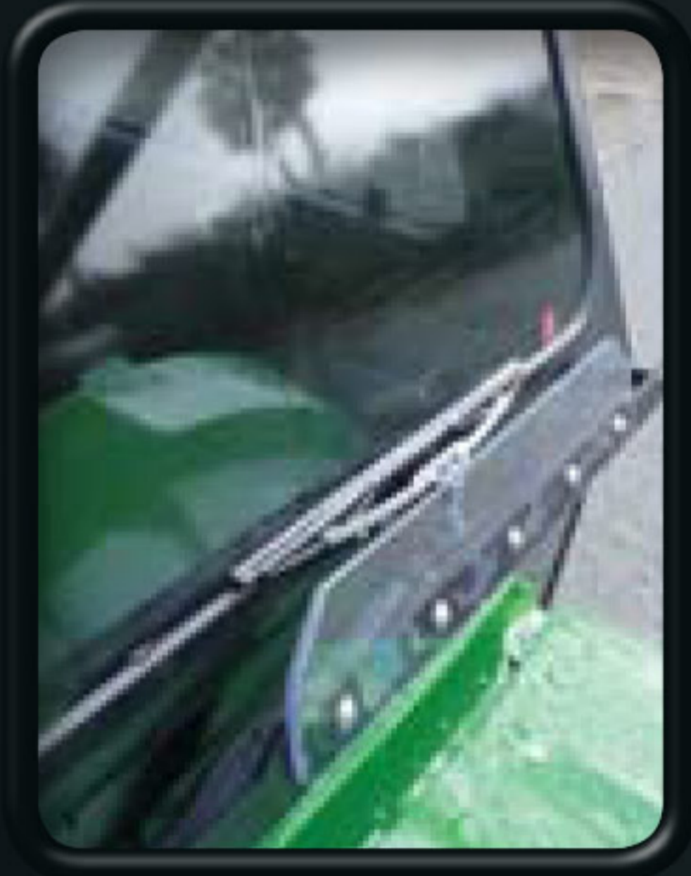
Windshield wiper standard with large wiper fluid reservoir.