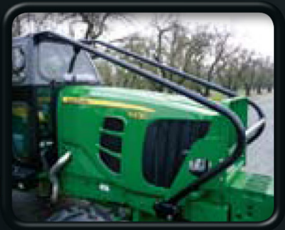
Limb lifter kits available as an option.