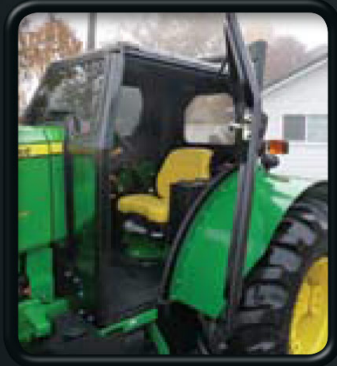
Large access door for comfortable entry.