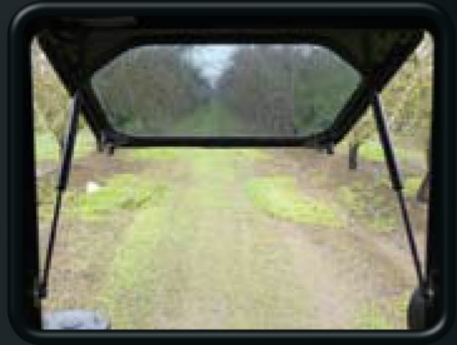
Large hinged rear window equipped with air shock for easy access and visibility during implement hook-up.